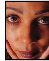
Helping cancer patients in Minnesota since 1990